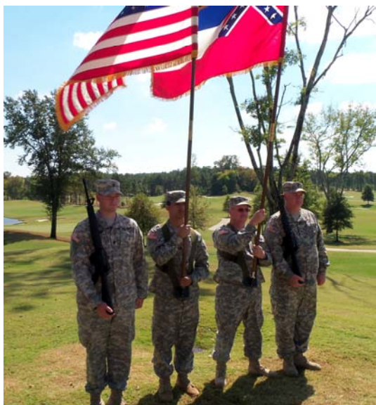
Members of the 112th Military Police Battalion

The fundraiser was a huge success in raising both awareness to the community about epilepsy and funding for Operation Outreach. This is a new program the Epilepsy Foundation of Mississippi is providing for our veterans returning home with TBIs.