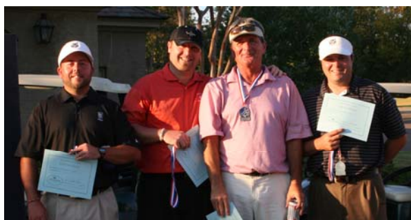
Sandhill Group 2nd Place winners!