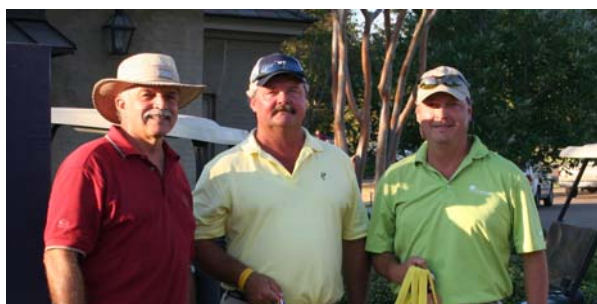
Entergy 3rd Place winners!